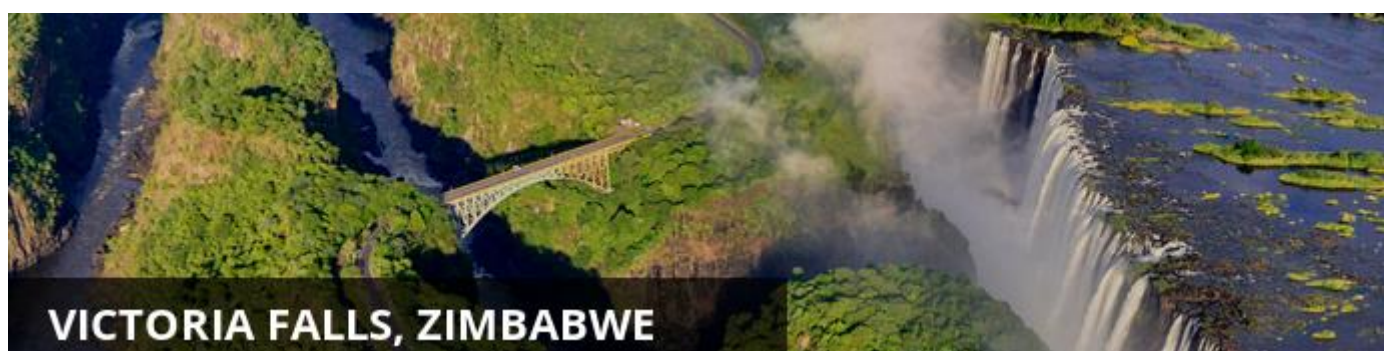
VICTORIA FALLS, ZIMBABWE

On arrival at Victoria Falls Airport you will be met by a Victoria Falls River Lodge representative who will assist with your transfer to the Lodge situated inside the Zambezi National Park, please note you may do part transfer by boat. Here, you spend two nights on a fully inclusive basis with selected activity inclusions. Please note that additional activities can be pre-arranged prior to travel at additional cost.